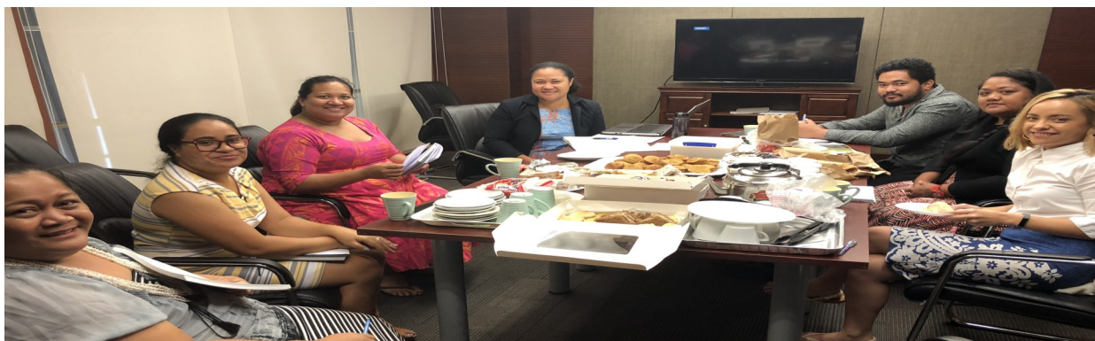
Legislative Drafting Division members during the Division Retreat on Wednesday, 26th September 2018.