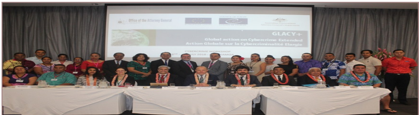
Phase 2 Workshop – Judicial, Law Enforcement and Prosecutors Training.