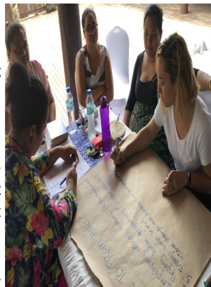
Legislative Drafting team during the team building brainstorm activities at the Office Retreat.

Prior to the division Retreat, each staff member of the Attorney General's Office had to undertake a management assessment for a survey that provided our honest and valuable feedback for our respective managers or Assistant Attorney General. The feedback results were confidential but the reviews and comment results from each division was discussed accordingly as a way forward to enhance better communication and work relationships in our division.