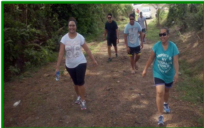
Above– Celebrating the end of the National Health Week up at Mount Palisi.