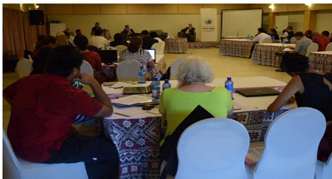
Attendees of the Workshop in Suva, Fiji from 25-27 November 2015