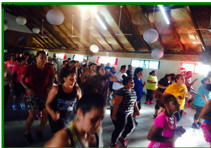
Below: AGO Zumba Fundraiser with Tempo Fitness at Maliu