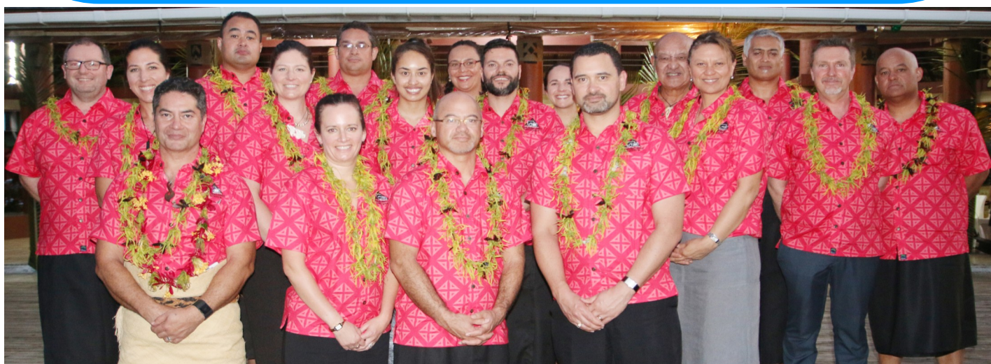
Some members of the Maori Law Society during the welcoming ava ceremony hosted by the Ministry of Justice, Courts and Administration at the Samoa Tourism Authority fale at Matagialalua.