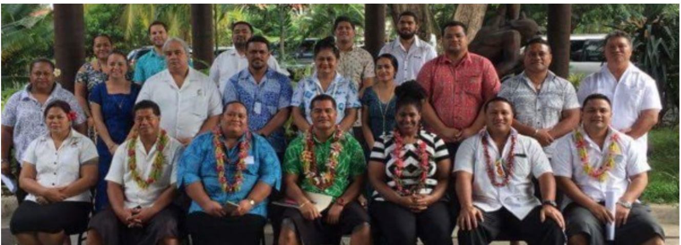
Participants of the Training including members from AGO.