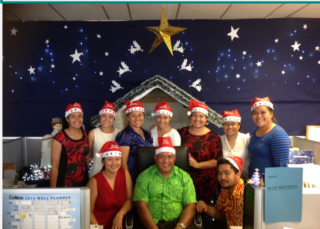
Members of the Legislative Drafting Division who took 1st place for the competition held on the 12th December 2014. (Full report on page 11)