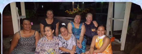
Madam Secretary of the Samoa Law Society (right), and other members of the Samoa Law Society during the function