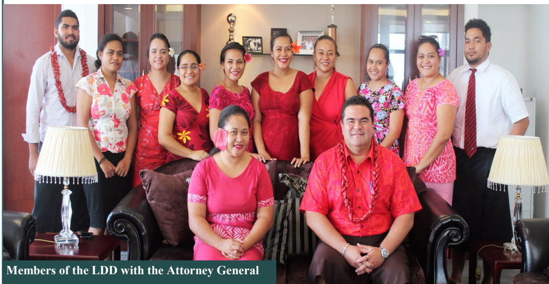
Members of the LDD with the Attorney General