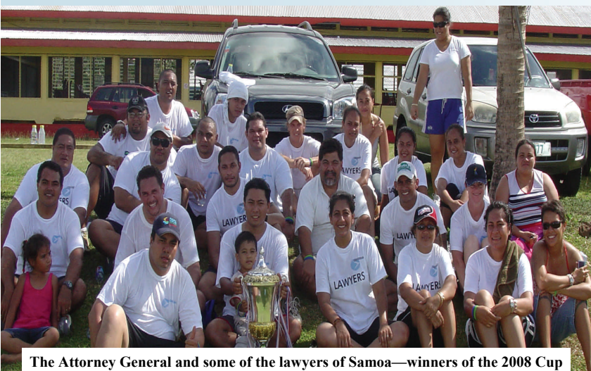
The Attorney General and some of the lawyers of Samoa—winners of the 2008 Cup

Every year, lawyers of Samoa go head to head with the doctors of Samoa in a one day sports competition for the annual Prime Minister’s Cup.