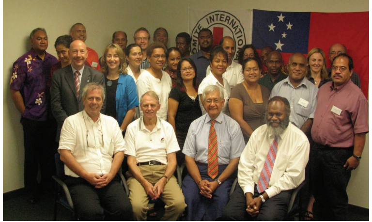
Regional delegates that attended the ICC Seminar ( 14 and 15 August)

One of the notable speakers at the Seminar was Judge Tuiloma Neroni Slade who was a former judge of the ICC