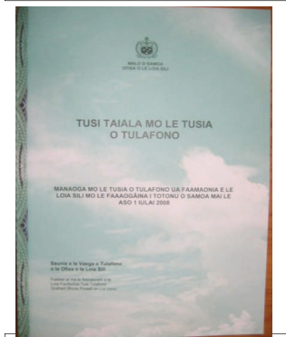
Samoan version of the Handbook